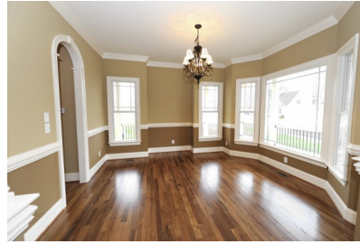
Commercial Paint world with a job in Gaithersburg for JDSU and the Hope Bible Church in Columbia.